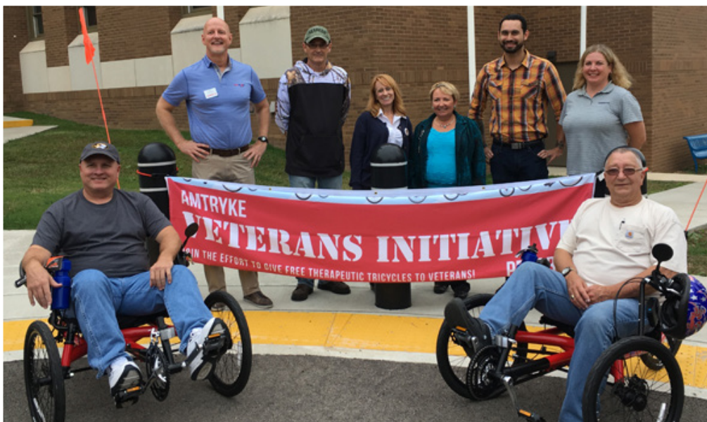
Veterans display donated adaptive bikes during a November 2017 Health on Wheels event at the John J. Pershing VA Medical Center in Poplar Bluff, Missouri.